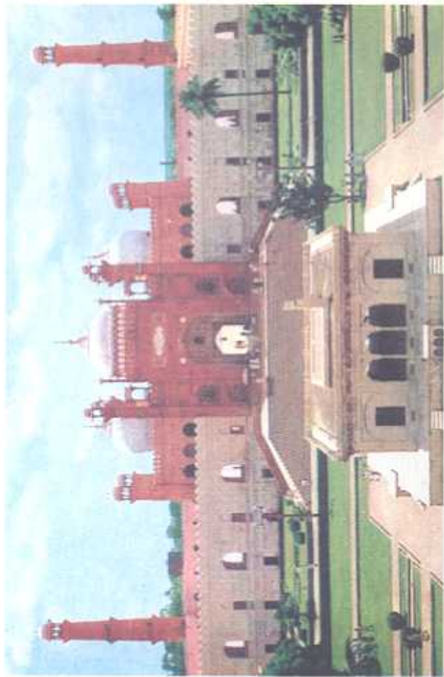
Badshahi Mosque; Lahore .